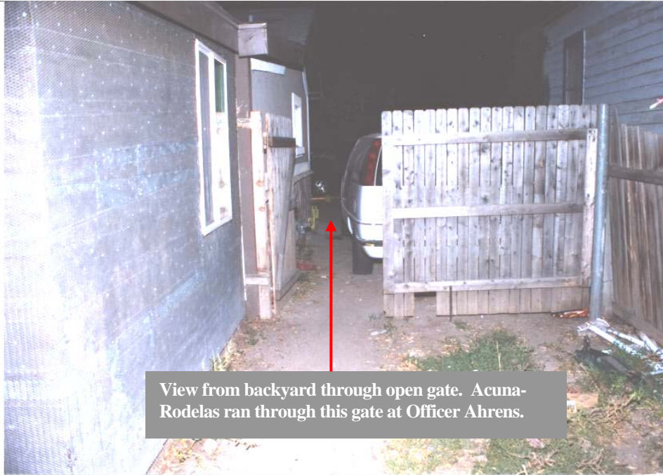
View from backyard through open gate. Acuna-Rodelas ran through this gate at Officer Ahrens.