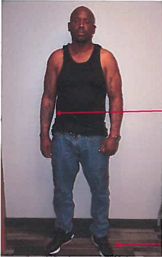
Photo of tattoos