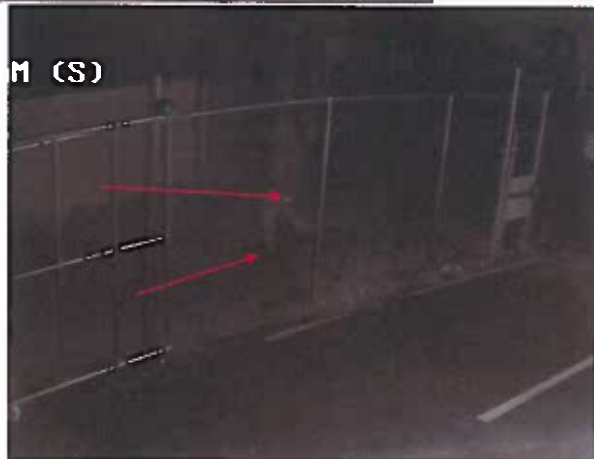
Suspect walking south behind 963 N Federal