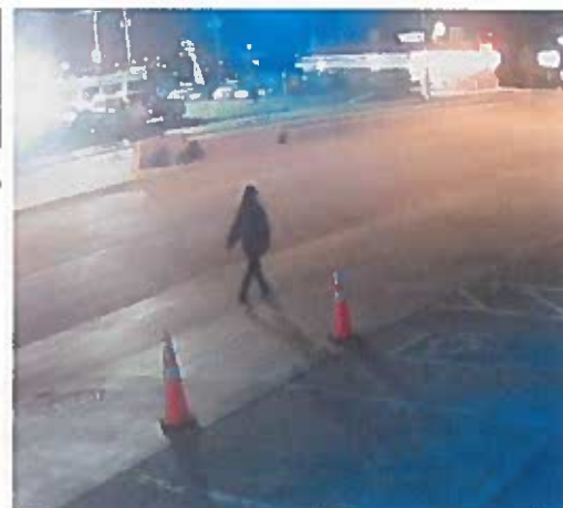
Victim walking south in front of 963 N Federal