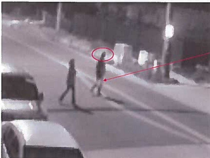
Suspect still carrying bag

At 4:22 AM, the victim and the same black male are captured on video crossing 10 th Ave northbound in the alley between Federal Blvd and Grove St into the alley towards 1065 N Federal Blvd.