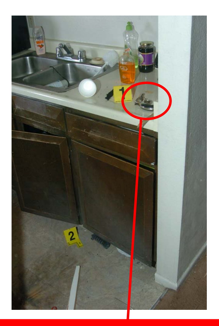
Five shot .32 caliber U.S. Pistol Co. revolver with five live rounds in the weapon when recovered on the kitchen counter.