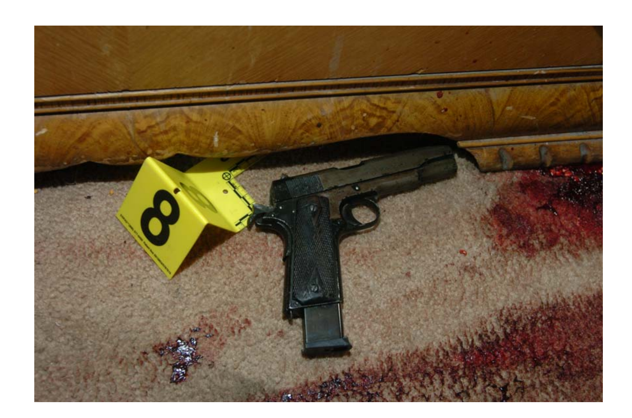
Colt 1191 U.S. Army .45 caliber semi-automatic pistol. Located under the edge of the dresser in the bedroom. Ten live rounds in the magazine when recovered. Boxes of ammunition for the recovered firearms.