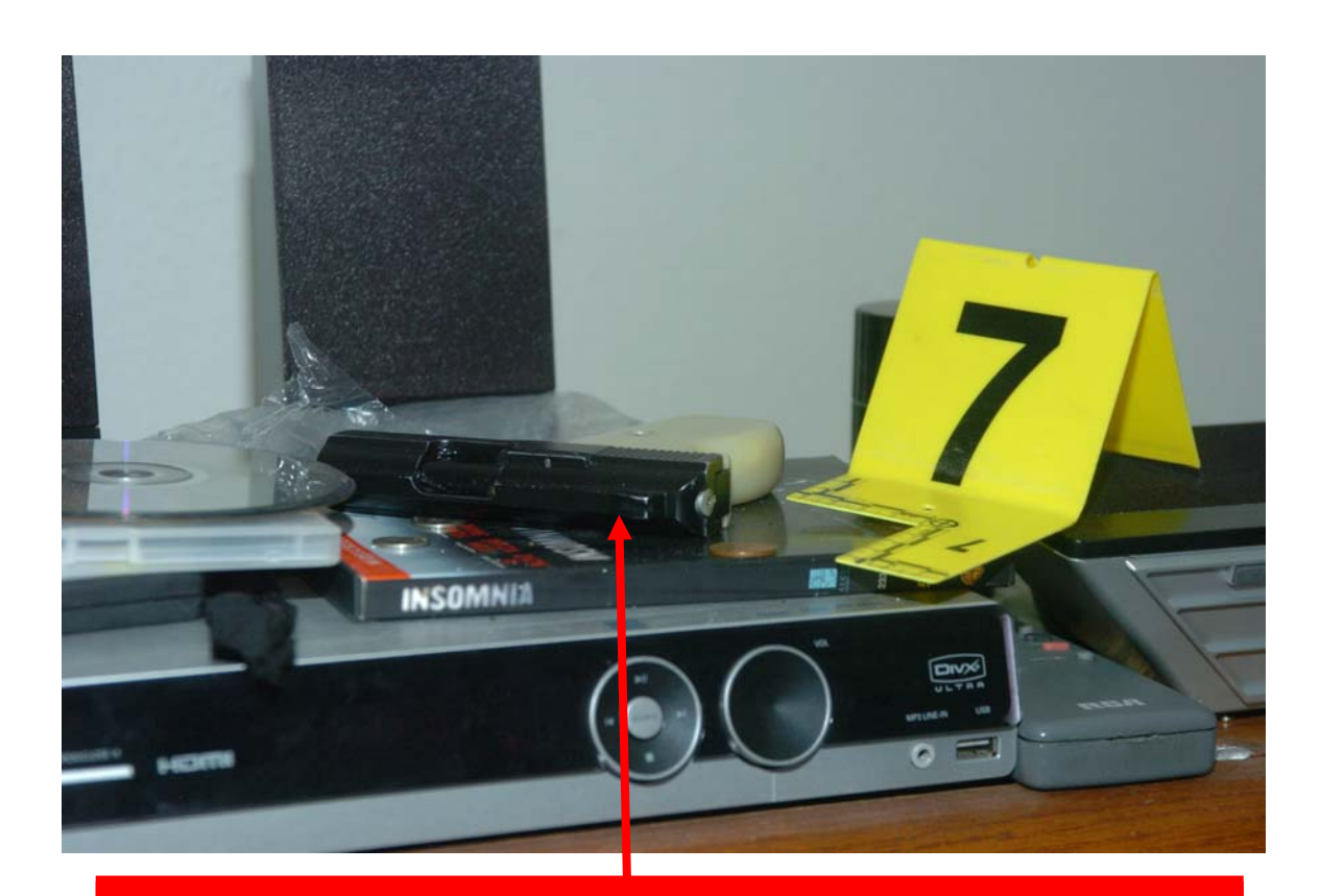
The .25 caliber semi-automatic pistol Guillard pointed at Technician McKibben before being shot. The weapon had one live round in the chamber and 4 live rounds in the magazine when recovered.