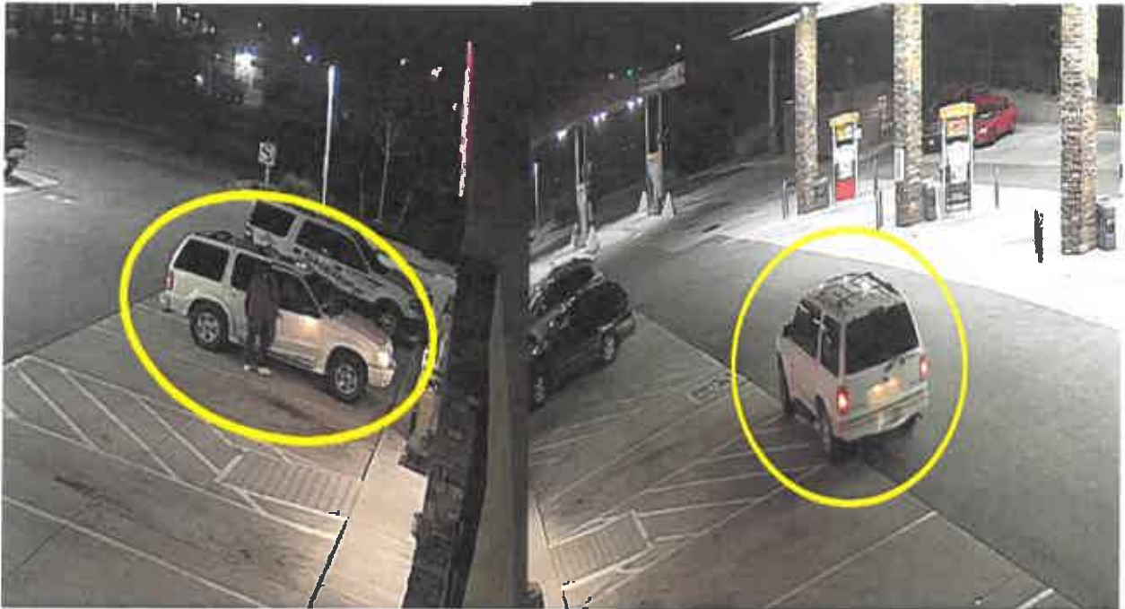
Figure 1: White Ford Explorer at Circle K with Officer Knight's patrol vehicle and female entering passenger side.

the convenience store and walk to the Ford Explorer and enter the front passenger seat. Deputy Tran arrived at the location as the Ford Explorer exited the lot and went southbound on N. Broadway St.