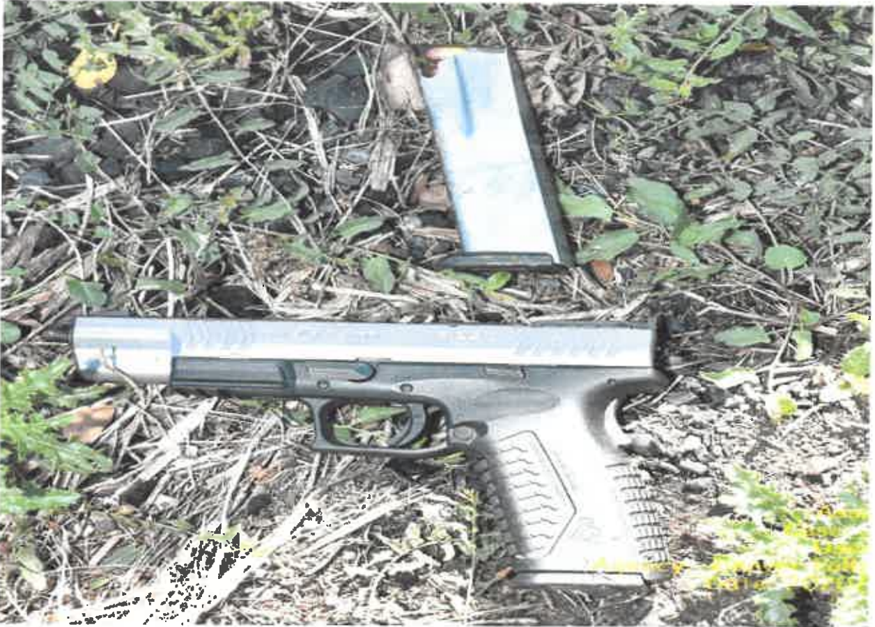
Figure 7: Suspect's gun and additional magazine.

Denver Health Medical Center Paramedics responded to the location and pronounced Mr. Escobedo dead at 4:30 a.m.