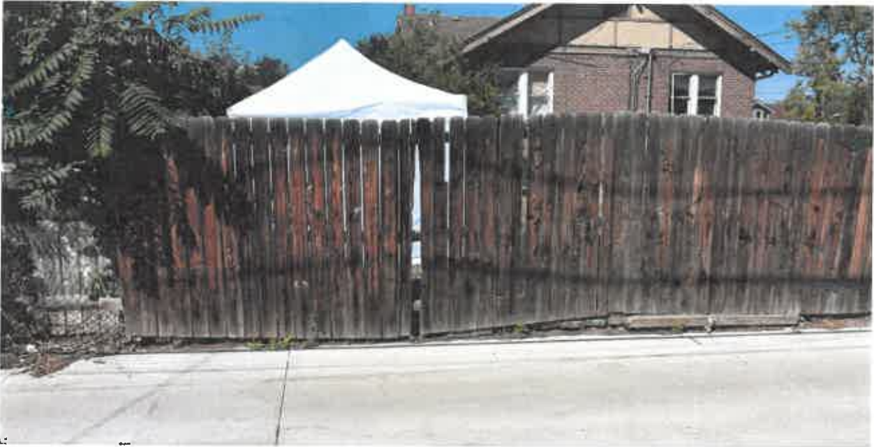
Figure 6: Deputy Engle’s and Deputy Tran’s position and view of the suspect and female hostage through fence.

Deputy Engle and Deputy Tran saw the suspect holding the female hostage at gun point and decided to move outside the yard and south down the alley, using gaps in the picket fence to continue observation of the suspect and hostage, while maintaining a parallel and “L” ambush position. Deputy Tran and Deputy Engle discussed taking a shot if given the opportunity. Deputy Engle, armed with his Sig Sauer 223 rifle, and Deputy Tran, armed with his Glock 17 9mm semiautomatic handgun, both obtained a good site picture of the suspect, positioning themselves to utilize the brick house as a background.