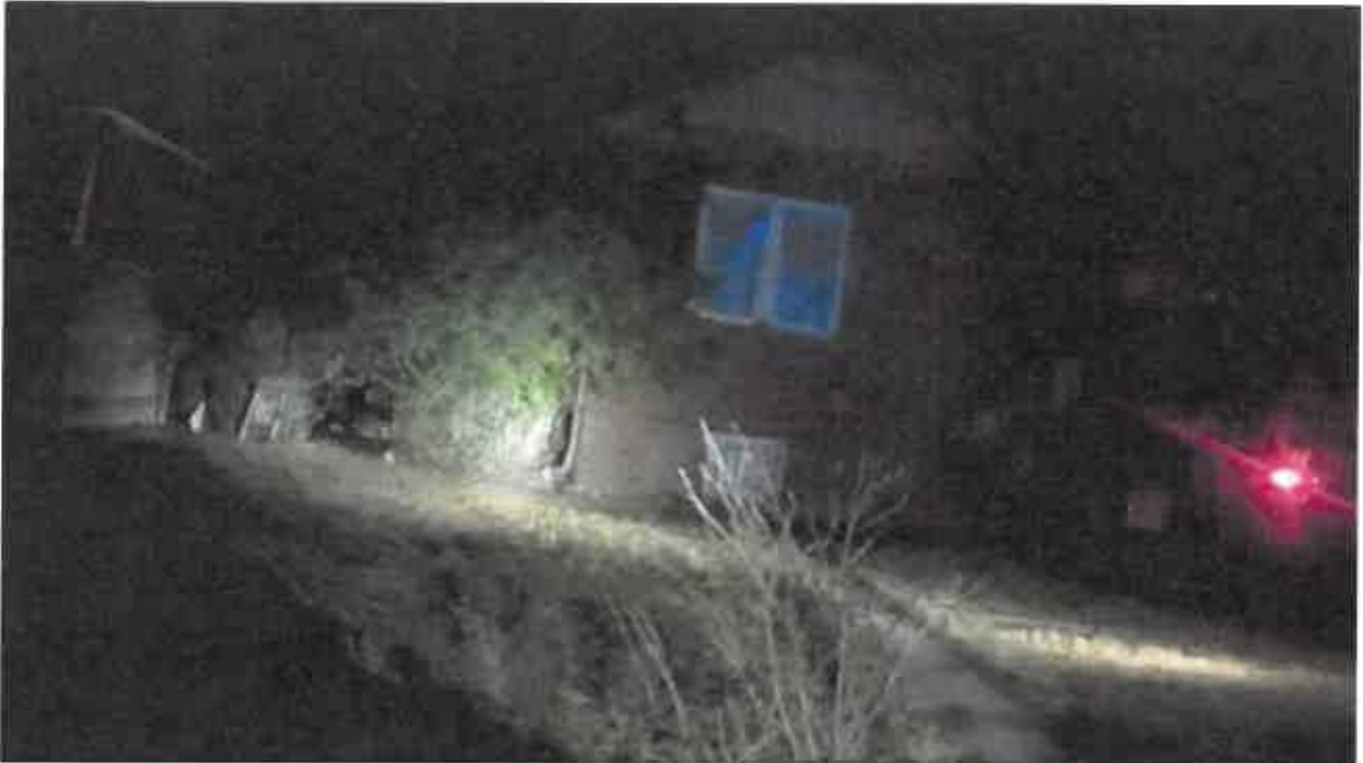
Figure 4: Bushes in southwest corner of 1540 N. Meade St. where suspect was holding female hostage.

Deputy Knight and Officer Cunningham moved to the area of the backyard, which was fenced to the south and east, but open to the north. Deputy Knight and Officer Cunningham, using weapon mounted lights, observed movement behind the bushes in the southwest corner of the yard. Though not fully visible, officers could see a white t-shirt and maroon sweatshirt moving behind the bush.