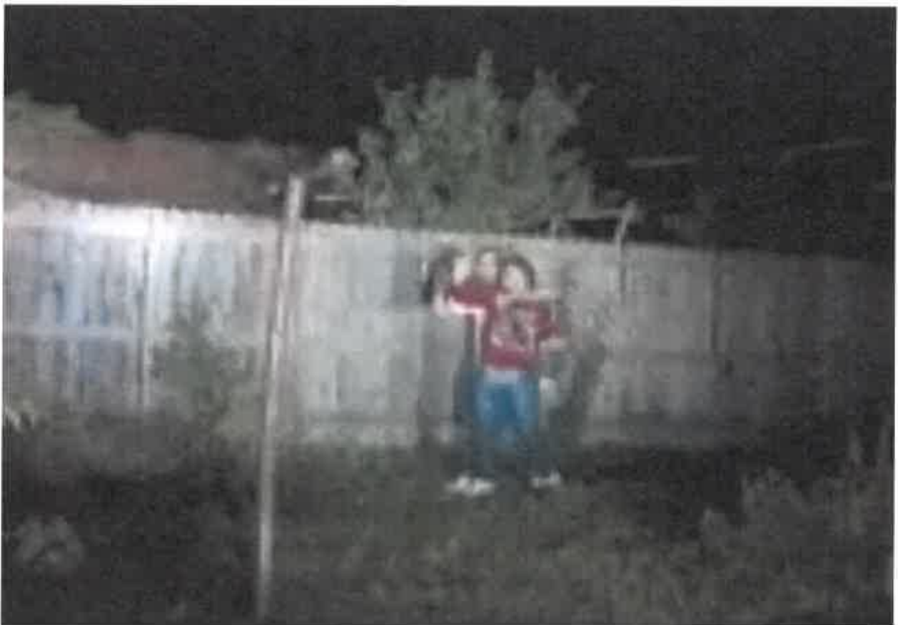
Figure 5: Suspect moving out from the bushes across the yard holding female hostage with left hand and pointing semi-automatic weapon to her head with right hand.

Officer Moen continued giving verbal commands. The female hostage yelled her hands were up and she and the suspect walked out from the behind the bushes. The suspect was holding the female hostage in front of him with his left arm and holding a silver/black semiautomatic handgun to her head with his right hand. Officer Moen continued giving orders to drop the gun. Officers with no cover or concealment in the yard, backed up while continuing to urge the suspect to give up.