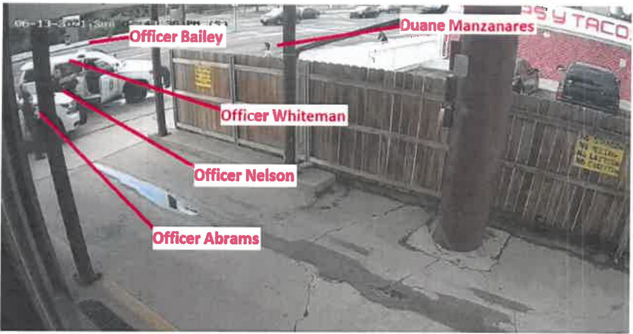
Figure 2. Still from surveillance video from nearby business.