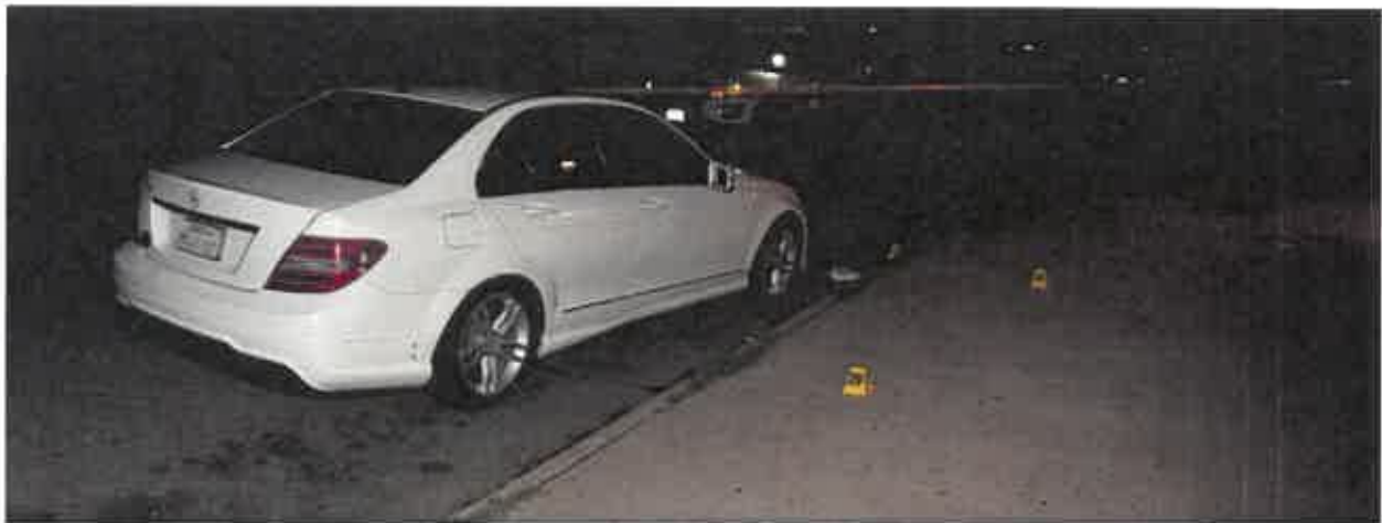
Figure 1. Four .45-caliber shell casings were recovered from the 1500 block of N. Ulster. Bullet strikes were noted on the car.

All of the involved officers activated their body-worn cameras prior to encountering Mr. Manzanares. The videos are of very good quality and display the events as perceived by the officers. Additionally, there is surveillance video of good quality and from different angles.