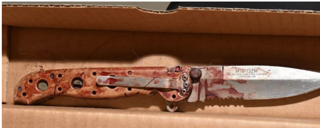
Figure 2. The knife used by Gallegos

The bloody knife held by Gallegos was placed into the DPD property bureau. It had a 3.5-inch blade.