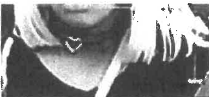
Unknown bank robber