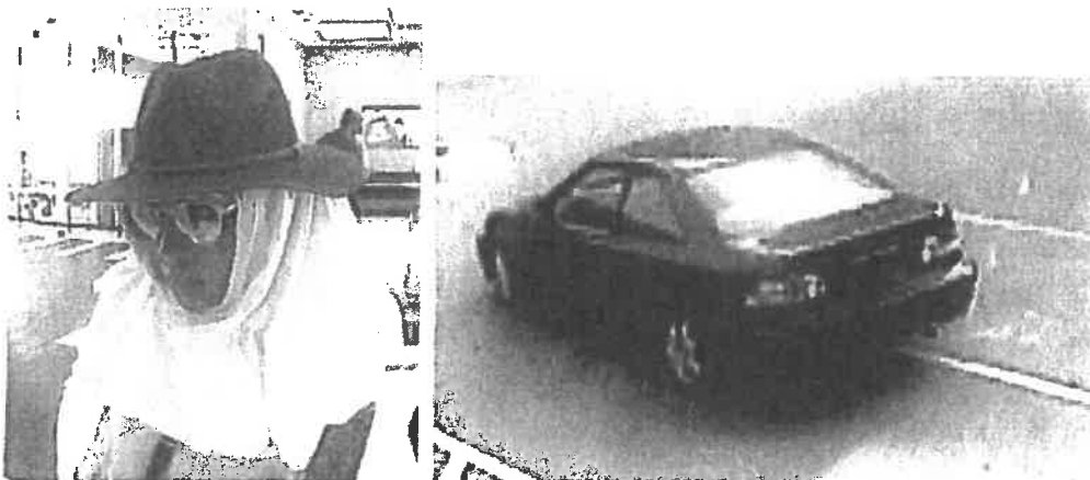
04/05/2019 Key Bank robbery suspect and getaway vehicle

glasses, white scarf over her head and shoulders, white long-sleeved shirt, latex gloves, multi colored spandex pants, white shoes and carrying a dark bag. The getaway vehicle was pictured backed in to the southernmost parking spot in the south side parking lot. The vehicle appeared to be a dark colored, possibly green, 2 Door Honda Civic, possible 1998-2000 model, occupied by an unknown getaway driver. The total loss to the bank was $1,859.00 in US Currency. Your affiant observed that the robber appeared similar in height, size, nose and lips, as the robber in robberies #1 and #2. Other similarities were that the robber used a head covering (hat) and wore glasses; wore white latex gloves; never spoke during the robbery; the robbery note indicated "no dye pack" and the getaway vehicle parked in close proximity to the bank, backed into a parking space. Below is a photograph of the unknown robber and getaway vehicle: