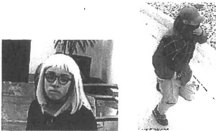
03/22/2019 Vectra Bank robber and unknown accomplice

his face and neck, maroon long-sleeved shirt, tan pants and dark colored tennis shoes with stripes. The total loss to the bank was $4,040.00 in US Currency. Below is a photograph of the unknown robber and unknown accomplice: