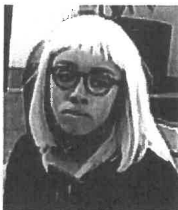
Unknown bank robber