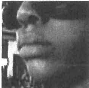
Unknown bank robber