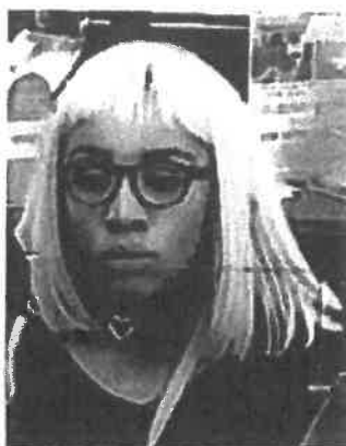
Unknown bank robber