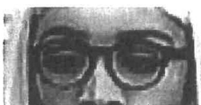
Unknown bank robber