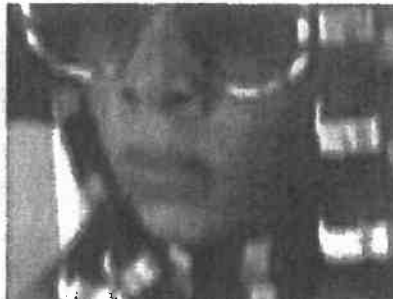
Unknown bank robber