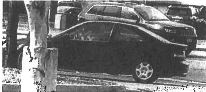
04/09/2019 Liberty Savings attempt robber and getaway vehicle/driver.