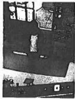
Dollar Tree- 4923 E. Colfax Avenue June 18, 2020 at 1125 hours