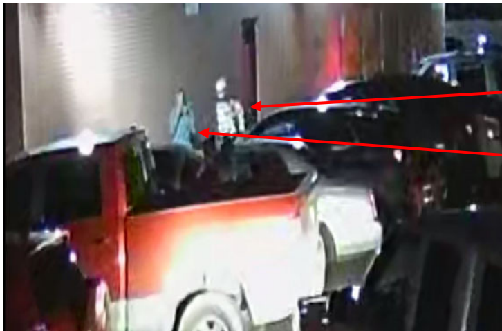
Driver of Chevy sedan

Shortly after the disturbance, at approximately 3:04:10 a.m. – 03:04:55 a.m. , your Affiant observed two involved males who appear to walk through the parking lot and by the front of the business, 5514 E. 33 rd Ave. The males do not stop to talk to anyone in front of the business and continue to walk towards the east side of the business and then back into the parking lot. Based on the video surveillance available, your Affiant was able to positively identify one of the males as, Shon MCPHERSON (dob: 07/01/1991). Your Affiant was able to recognize MCPHERSON due to your Affiant conducting an interview with MCPHERSON on November 5, 2023 , later in the day after the incident. The interview was conducted at Swedish Medical Center where MCPHERSON was being treated as a gunshot wound victim as a result of the shooting. The following photos are taken from the surveillance and are MCPHERSON along with the unknown male driver of the Chevy sedan.