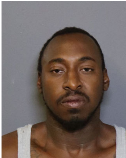
Adams County Mugshot 10/31/2023

C.R.S. 18-3-102; 18-2-101 – Criminal Attempt to Commit Murder in the First Degree (F2)