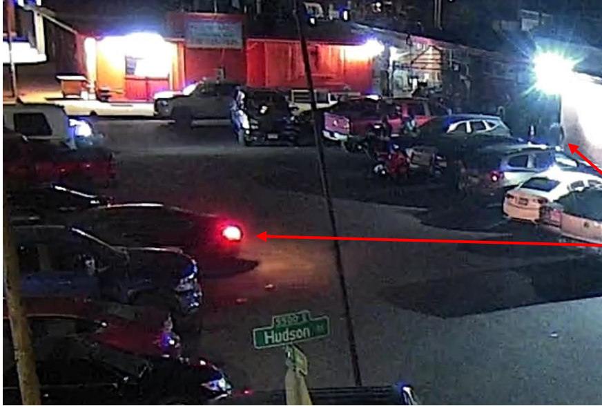
McPherson Chevy backing out

While this is going on, the silver/grey Nissan SUV exits the parking lot and repositions itself onto E. 33 rd Avenue, facing eastbound.