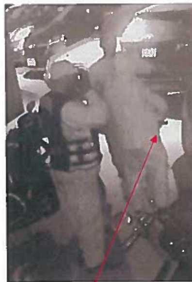
Extended Magazine to Washington's firearm.