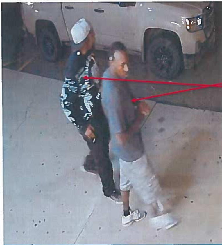
McPherson and unknown male driver of Chevy Impala appear to be scouting location.

Simultaneously, Todd WASHINGTON approaches the silver/grey Nissan SUV as MCHPERSON, and the other unknown male appear to be scouting the location.