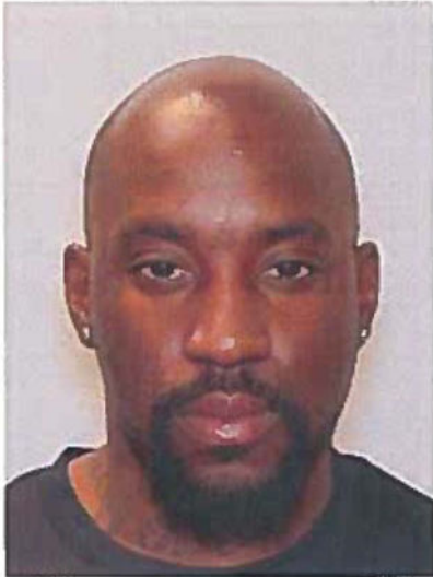
DMV Photo of Washington Taken 02/12/2021