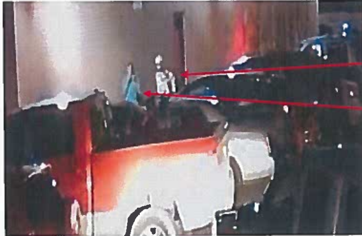
Driver of Chevy sedan