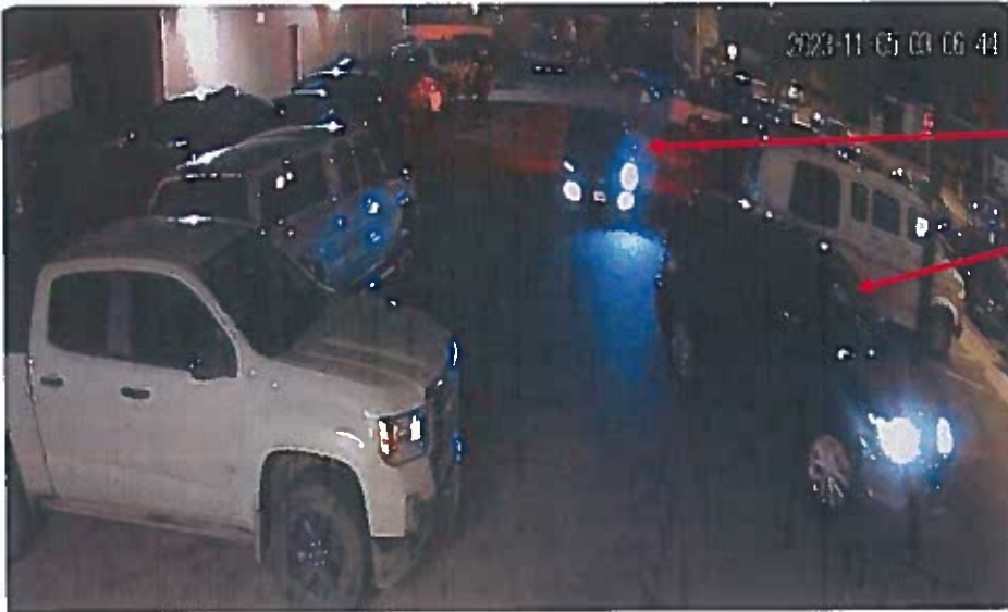
Black Chevy sedan and silver/grey Nissan SUV position themselves to flee the area.

While this is going on, the silver/grey Nissan SUV exits the parking lot and repositions itself onto E. 33 rd Avenue, facing eastbound.